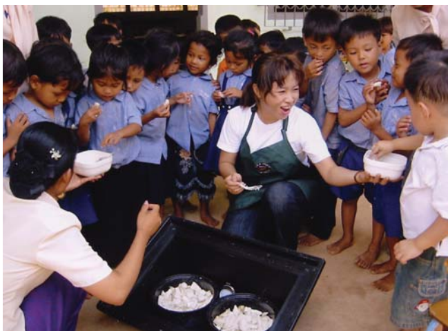
Solar Oven made out of plastic beverage bottles feeds an entire school class in a third world country