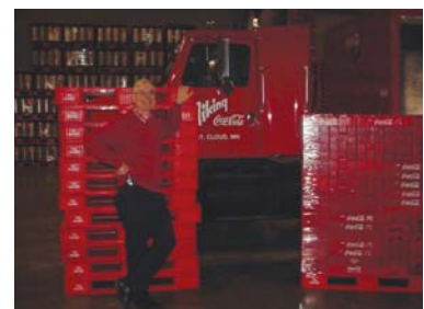
Viking Coca-Cola Bottling invested in plastic reusable pallets and transport containers