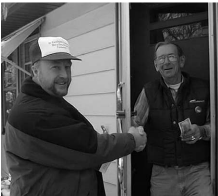
Gillette Pepsi Rochester & Freeborn County Get Caught in Albert Lea