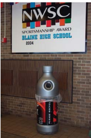
Blaine High School