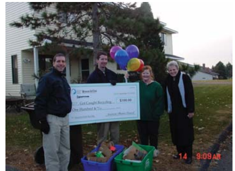
Washington County Get Caught Day