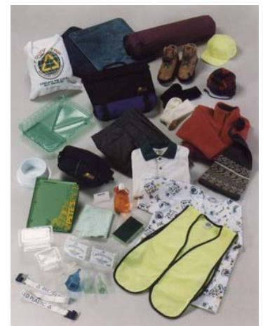
Products made out of recycled plastic beverage bottles

Recycled PET can be used to make many new products, including fiber for polyester carpet; fabric for T-shirts, long underwear, athletic shoes, luggage, upholstery and sweaters; fiberfill for sleeping bags and winter coats; industrial strapping, sheet and film; automotive parts and new PET containers for both food and non-food products.