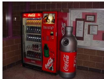
The need for recycled PET is enhanced by the refreshments industry using 10% recycled content in its plastic bottles.

Refreshments MN-MSDA recognizes the importance of creating markets for recycled beverage containers. The industry, especially The Coca-Cola Company Foundation, sponsored a workshop and contributed tens of thousands of dollars in research for the solar cooker project. This cooker made from recycled plastic beverage bottles is manufactured in Minnesota and is given to many third world countries replacing their dependence on wood fires.