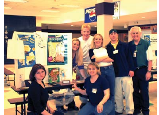
Albany Middle School/High School with Recycled Products Kit