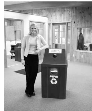
Bernick Companies provide recycling bins