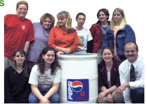
Apollo High School Science Club

Since 2002, over 100 school grants have been awarded to develop or enhance recycling programs. The schools received $500, t-shirts, a recycled products kit, recycling bins, and technical assistance. Students and teachers conducted the programs that resulted in recycling awareness, tons of recycled beverage containers and ongoing recycling programs.