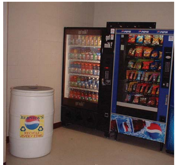
Elk River High School

The Yellow Medicine East High School's Student Council has their special needs class in charge of the recycling efforts. The grant dollars paid them each week for their service of emptying the barrels and dumping them in the recycle bin. They earned $480 ($15 x 36 weeks) for field trips and special equipment in their classroom. They also had a "clean up the neighborhood" activity with the entire student body. The job coach who works with the boys on the project is on of their paraplegic students.