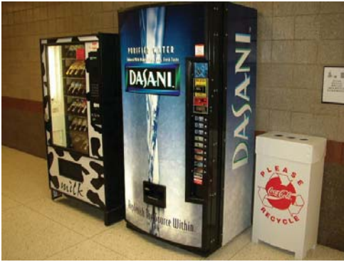
St. Michael/Albertville School