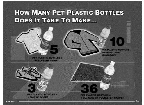
Slide from customized education program that Bernick Companies has presented over 200 times in the past 3 years to schools, youth groups, and civic organizations

Over 400 recycled products kits have been given away to schools or other organizations. The kits contain 15 to 20 everyday products that are made out of recycled material or are materials that can be easily recycled. The recycling process is explained and background information is provided on each product. Students can touch and see first hand the products. Several posters provide colorful stories about the process and answer frequently asked questions about recycling.